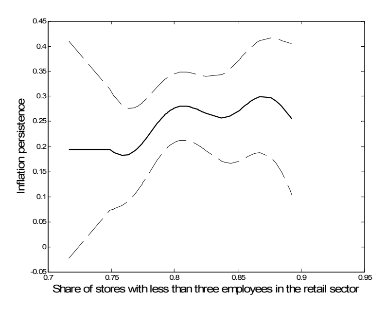
Note: for this picture we resorted to a Gaussian kernel estimator with Silverman's optimal smoothing bandwidth.